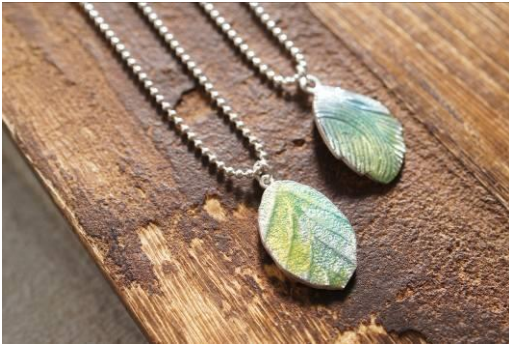
Completed piece (Left)